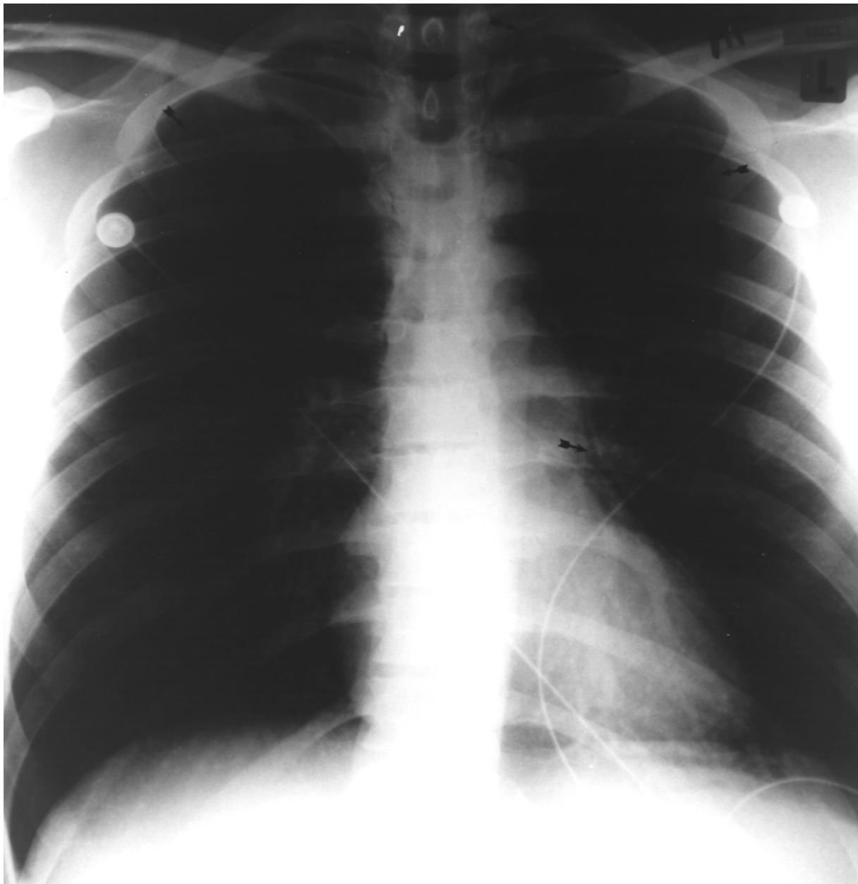
Figure 1. A-P chest X-ray demonstrating bilateral pneumothoraces, (black arrows at the level of left and right second ribs), left mediastinal emphysema (black arrow) and subcutaneous emphysema in the neck (white arrow).

60 minutes with a 30 minute ascent) in the next three days. He was discharged with bilateral 6/5 vision.