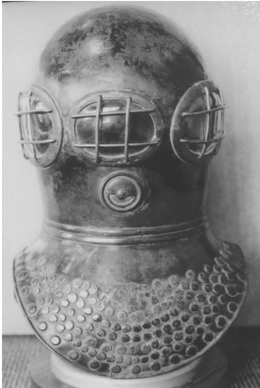
Figure 1. 1823 Smoke helmet, photographed at Siebe Gorman. This is the helmet patented in 1823 by Charles Anthony Deane and manufactured by Augustus Siebe. In 1829 it was used as the prototype for a diving helmet.