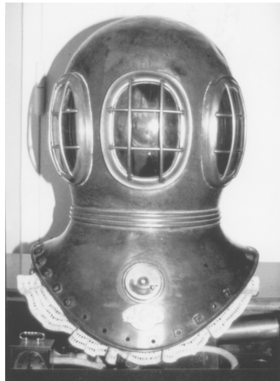
Figure 2. 1830, Deane helmet (France), the first dedicated diving helmet.

the sea bed. There were also major bonuses when a stranded vessel could be saved or a valuable cargo recovered from a wreck. But the methods used were crude, involving long poles with tongs on the ends, worked from the surface. Even a small diving bell had been tried. When John and Charles Deane compared notes, the idea dawned. Charles's smoke helmet was really like a small diving bell. So the two brothers set about modifying a smoke helmet and made a prototype diving helmet. In 1828 they tested their idea in Croydon Canal, just half a mile from Charles's home in Deptford and the system was brought to "full perfection". 7