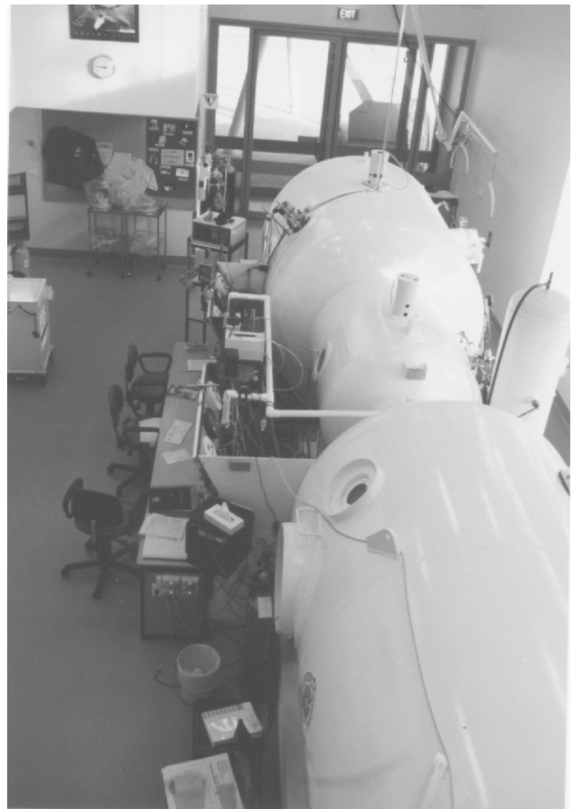
Figure 1. Looking down on the old Alfred chamber complex in 1996. The double glass doors open onto the helipad. In the top righthand corner is the ingenious crane arrangement needed to insert stretchers into the chamber. The stretcher was inserted into the two white half circles which hooked under the stretcher handles. Then the travelling beam was moved in through the entry door and the patient and stretcher were moved over one of the bunks shown in Figure 2 while the beam was lowered so that the stretcher could touch down. The narrow portion of the complex was a second, much smaller, compartment of the main treatment chamber.

Shore Hospital in Sydney who had completed the research program for which the chamber had been used. It was transported to Melbourne and installed with Lions Club funding, proving to be a useful additional resource.