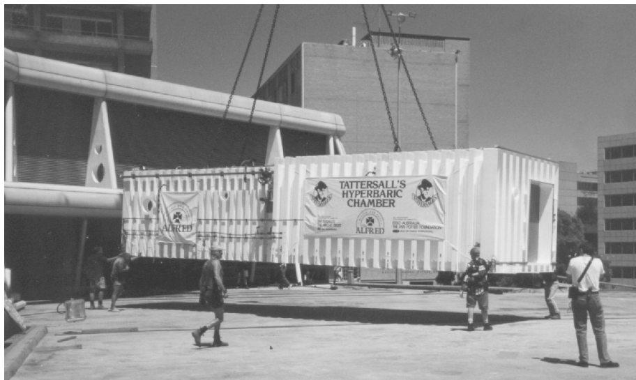
Figure 3. The new chamber being delivered in 1999.