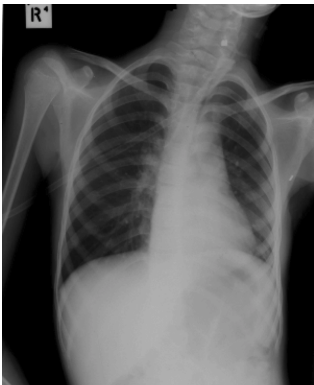
Figure 4. An early X-ray of AB's chest. The endotracheal tube can be detected running down the neck across the mediastinum and into the right lung field.