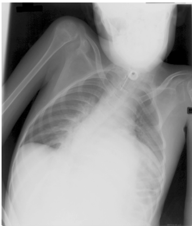
Figure 5. Later X-ray showing shortening of the ribcage and the presence of a tracheostomy tube.

computer opened a new world, even though someone else has to work the keyboard and read the screen to him.