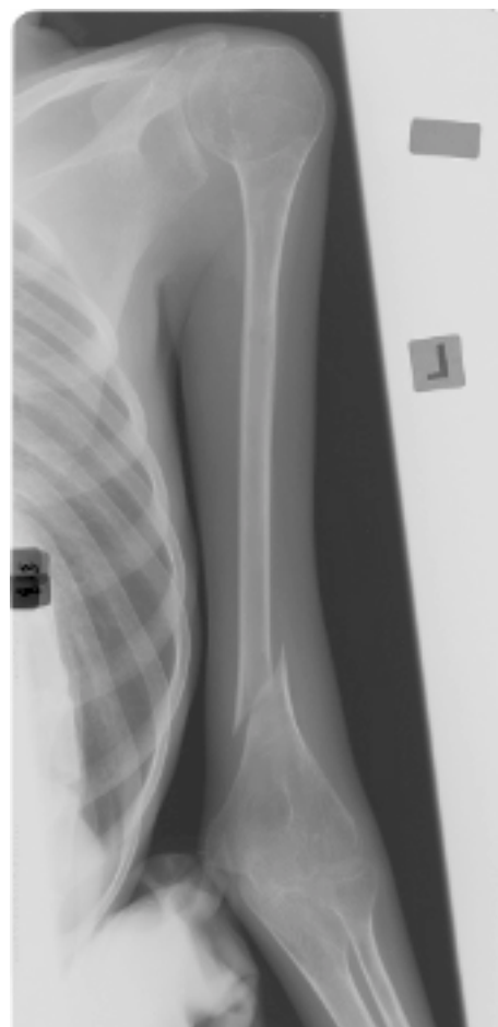
Figure 3. Fracture of lower end of left humerus showing osteoporotic bones.