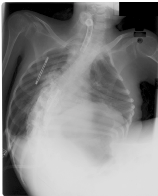
Figure 6. Later X-ray showing tracheostomy tube and extreme scoliosis.