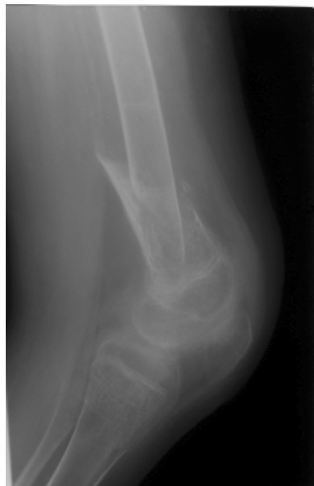
Figure 2. Fracture of lower end of femur showing muscular wasting and osteoporotic bone.

His teenage years were difficult. He insisted on total immersion baptism when he found religion. Having a