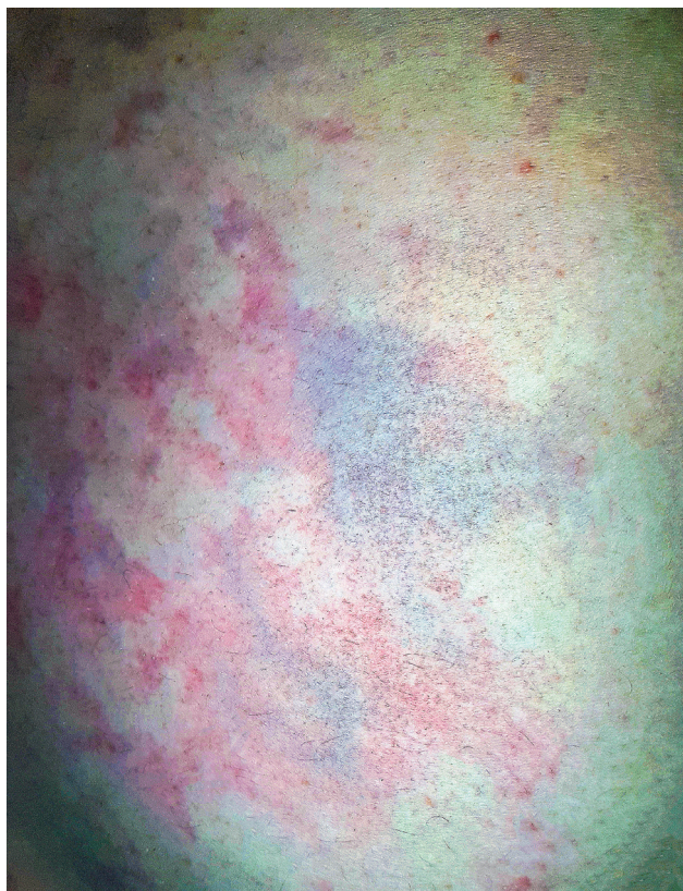
Figure 1 Cutis marmorata rash post-diving

procedure contrast had been injected antecubitally, but no provocation measures were performed as the patient was sedated. Trans-thoracic echocardiography (TTE), this time performed in Malta, with antecubital vein injection of two separate boluses of bubble contrast, one at rest and one with provocation manoeuvres after the third episode of DCS, had shown an atrial level shunt with minimal spontaneous shunting. Abdominal compression and prolonged Valsalva augmented flow across the shunt. The diver elected not to change her diving practices seeing the small documented size of the atrial level shunt at this point. TTE performed in Malta eight weeks following the fourth episode of DCS, with intra-femoral injection of two boluses of bubble contrast to avoid the effect of the Eustachian valve, showed a large PFO with manifest spontaneous right-to-left shunting. The diver elected to proceed with percutaneous PFO closure.