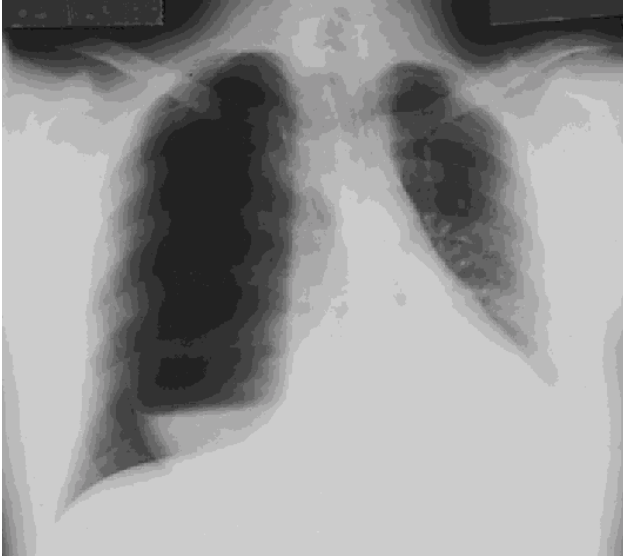
Figure 3 . Chest radiograph (Case 3) showing large right pneumothorax with giant right upper lobe bulla containing fluid.

Figure 1 . Chest radiograph (Case 1) showing small right apical pneumothorax with mediastinal emphysema and a large bulla in the right upper lobe.