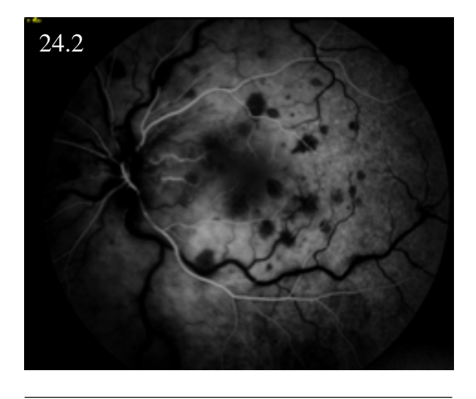
Figure 1 Fundus fluorescein angiography of the left eye showing slow filling of the CLRA with dye (image taken at 24.2 s)

count, coagulation screen, C-reactive protein, fasting blood glucose, homocysteine level, and liver function were all normal, as were electrocardiography, chest X-ray, carotid ultrasonography and transthoracic echocardiography. The only abnormalities noted were high LDL-cholesterol (157 mg·dl<sup>-1</sup>) and triglyceride (244 mg·dl<sup>-1</sup>) levels. The patient was begun on anti-hyperlipidaemia treatment. His blood pressure was not lowered during the event but later on he was started on antihypertensive medications with beta-blockers on a regular basis.